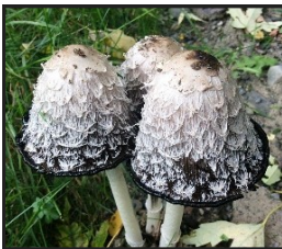
Shaggy Ink Cap

The star of the autumn foraging season is surely the blackberry. Childhood memories seem to be full of sunny days spent roaming the countryside and picking blackberries, coming home with mouths stained with juice and arms and legs covered in scratches, but with boxes and baskets full of berries to make apple and blackberry crumble or bramble jelly. During World War II syrup made from rose hips was very popular to supplement a wartime diet short of vitamin C. The syrup is not fashionable nowadays but rose hips do make a very palatable home-made wine. Hawthorn berries are not so well-known as an ingredient but mixed with apples they also can make a tasty wine of a delicate pink colour. And of course one of the stars of the autumn drinks cupboard is sloe gin. Perhaps we should all be out stocking up on the fruit, though it easier to process after the first frost has softened the berries. Sloe gin improves dramatically with age. If you can bear to wait a year or two you will have a beautifully rounded mellow drink to enjoy by the winter fireside, perhaps with a few locally picked nuts.