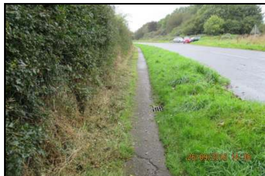
Trebursye footway, before and after cutting