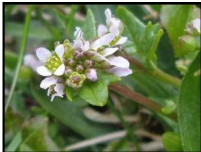
Danish Scurvy Grass

It acquired its common name because it is rich in vitamin C, and the story goes that sailors on their way to and from their ships in Plymouth stuffed themselves with scurvy grass to counteract the effects of the vitamin C deficiency which was common among sailors until the late 18 th century. The link was established between scurvy (characterized by swollen bleeding gums and the opening of previously healed wounds) and the poor diet of the crews by a Royal Navy surgeon, James Lind. He proved it could be treated with citrus fruit in experiments he described in his 1753 book A Treatise of the Scurvy . Eventually ships would carry supplies of lemon to treat scurvy, but the sailors obviously realized that they could help themselves by eating scurvy grass.