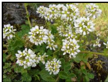
Common Scurvy Grass

Coming into summer the hedgerows in this area become packed with a small white-flowered plant known as scurvy grass.