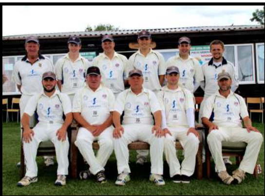
South Petherwin Cricket club first team