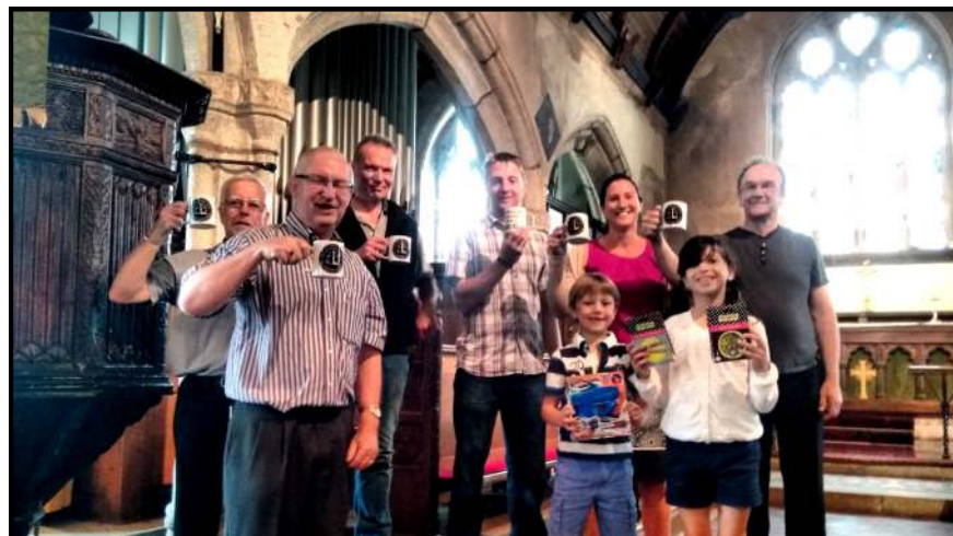
The South Petherwin Community Shop Committee

If you'd like to advertise any item for sale, or celebrate a birthday or anniversary, or just shout about something special please email -hmnorthmore@msn.com or contact any of the magazine committee (details back page)