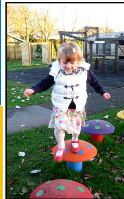
Eva Tucker (6) enjoying the new playground

Members of the public welcome at all these meetings