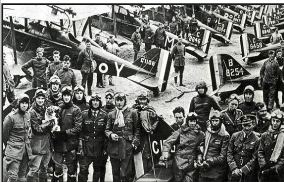
No 1 (F) Squadron is the RAF's oldest unit

even though the life expectancy of pilots could often be measured in months or weeks and sometimes days.