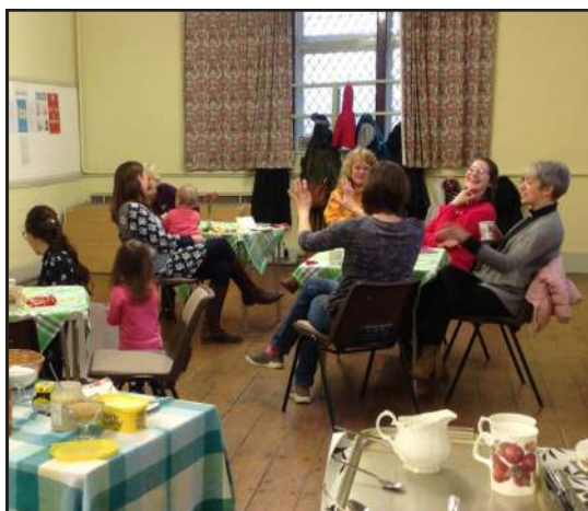
Sharing a joke at Tea and Toast

PS: Watch out for our scarecrow as we celebrate with the community during the centenary events week.