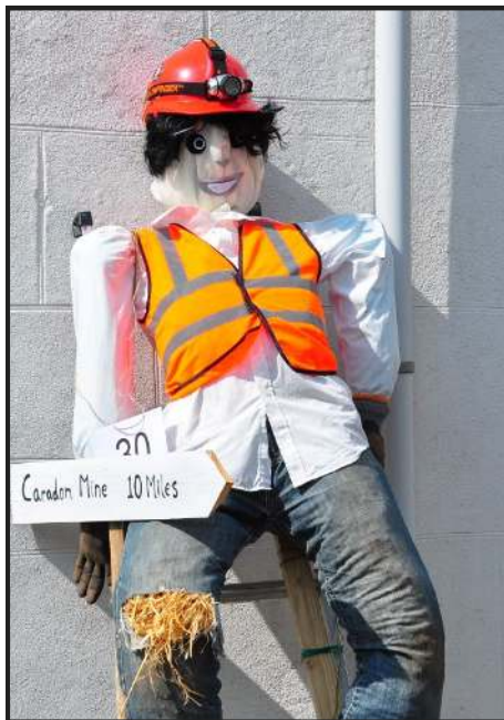
And another scarecrow!

ALL JOBS CONSIDERED AND COMPETITIVELY PRICED